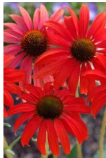
Left: Echinacea "Tomato Soup"

The hot garden is where you'll find the brightest stars in the Homestead garden. Each season brings new delights, but my favourite perennials would be the red daylilies, flowering now, and then followed by the red cannas, Echinacea 'tomato soup', and then Gazania 'Takatu red'. All excellent fillers, along with the usual annuals of impatiens, geraniums, and begonias. A very bright picture that will only get better as Summer approaches.